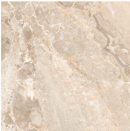
ANTICA CREMA 60,5x60,5 cm