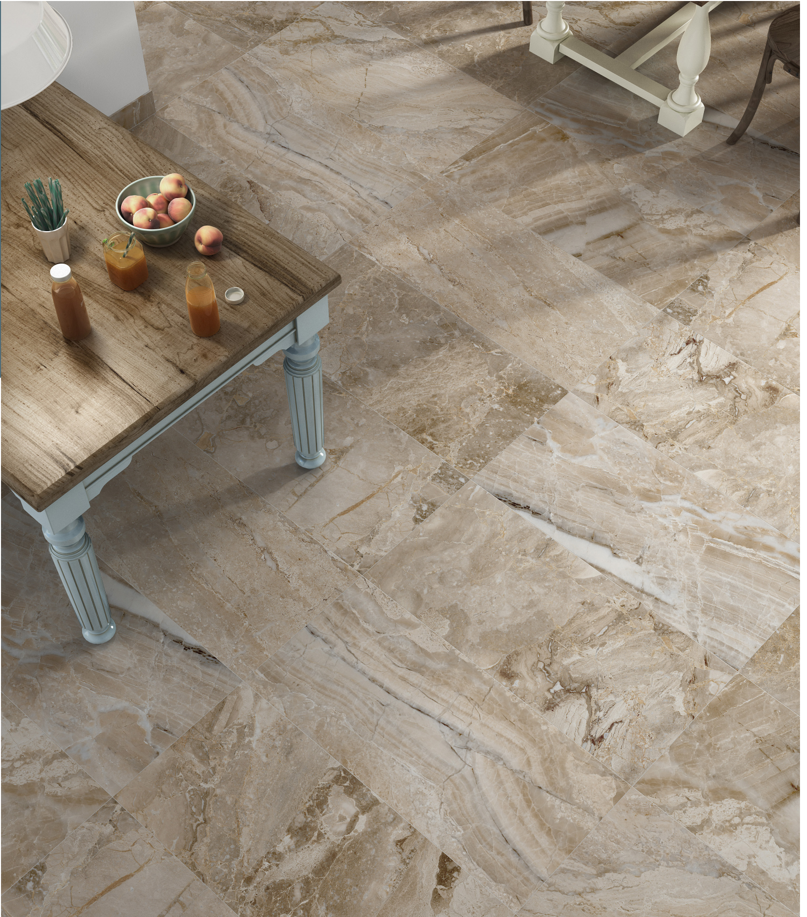
PAVIMENTO: ANTICA NOCE 45x90 cm.