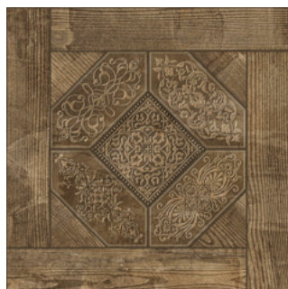
AVIGNON NOGAL 45X45 B16