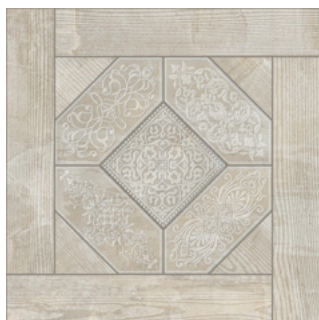
AVIGNON ARCE 45X45 B16