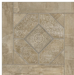
AVIGNON ROBLE 45X45 B16