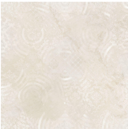
BORNEO DECOR 60X60 B30