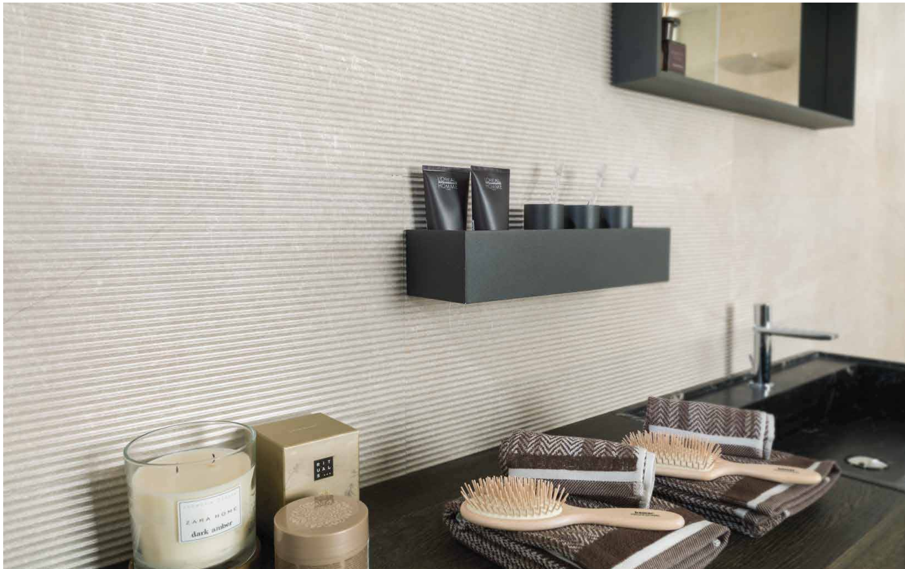
# DECO BOSTON TOPO 31,6x90cm