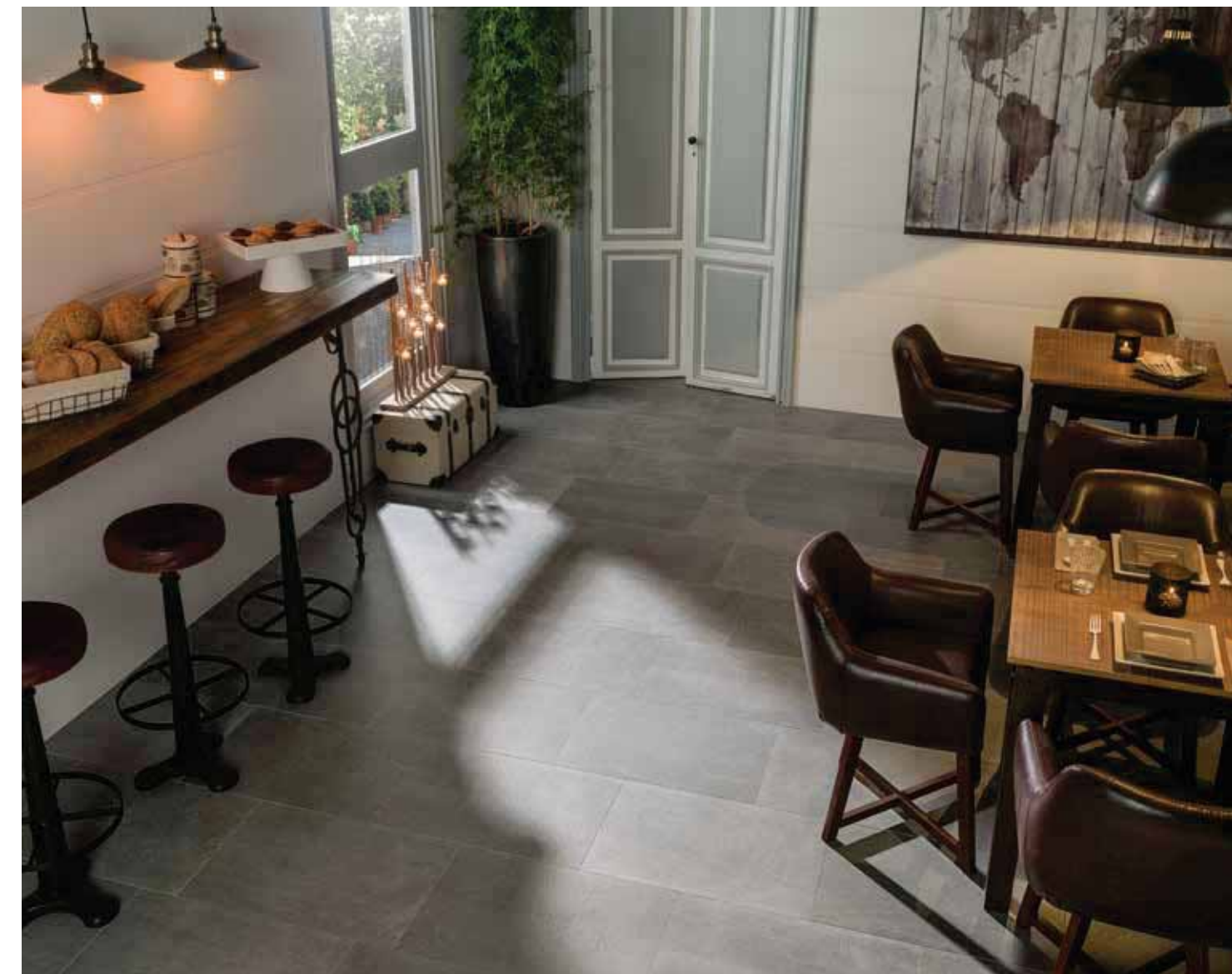
# BOSTON STONE 43,5x65,9cm