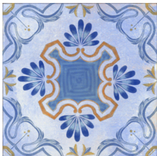
CHELSEA DECOR 20X20 B30