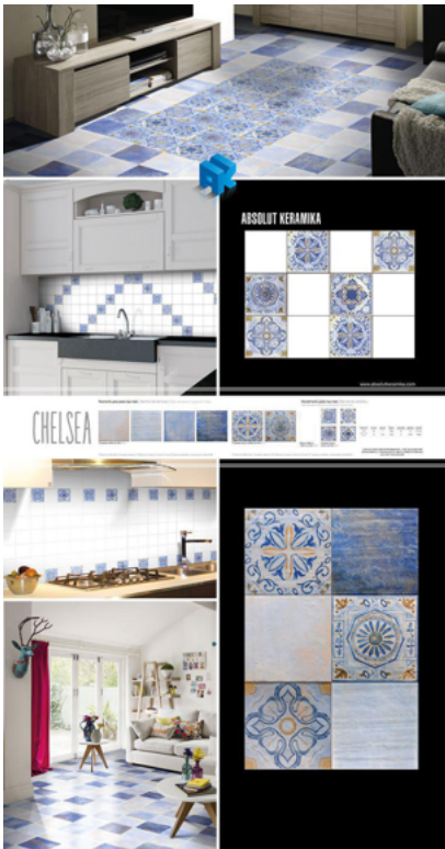
PT CHELSEA 20X20 10X10 MILANO (100.5x192.5)