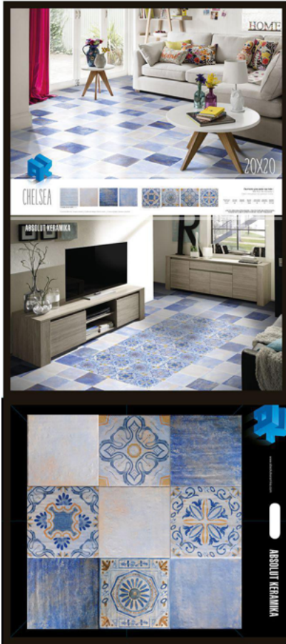
PE CHELSEA+DECOR 20X20 (80x180)

tel: (+34) 964 657 738 fax: (+34) 964 322 151