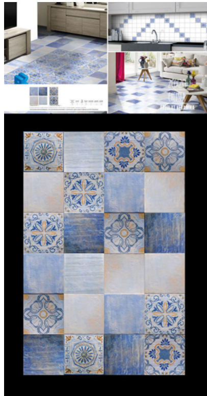
PT CHELSEA 20X20 (100.5x192.5)