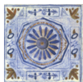
CHELSEA DECOR 10X10 B61