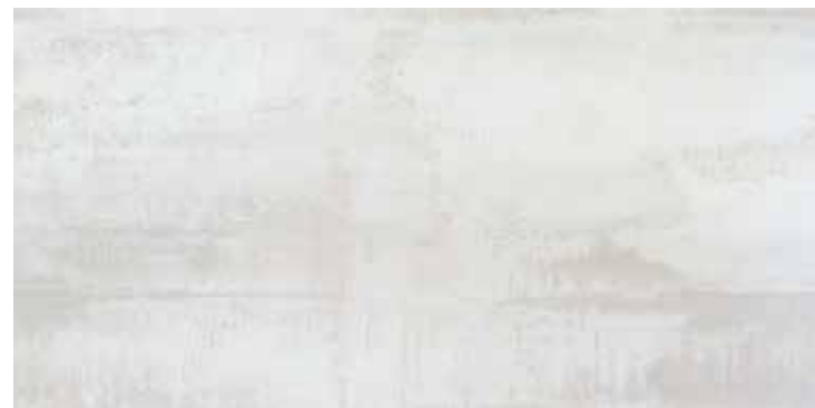
DORIAN WHITE RECT. 60X120 / 24"X48" T24/M