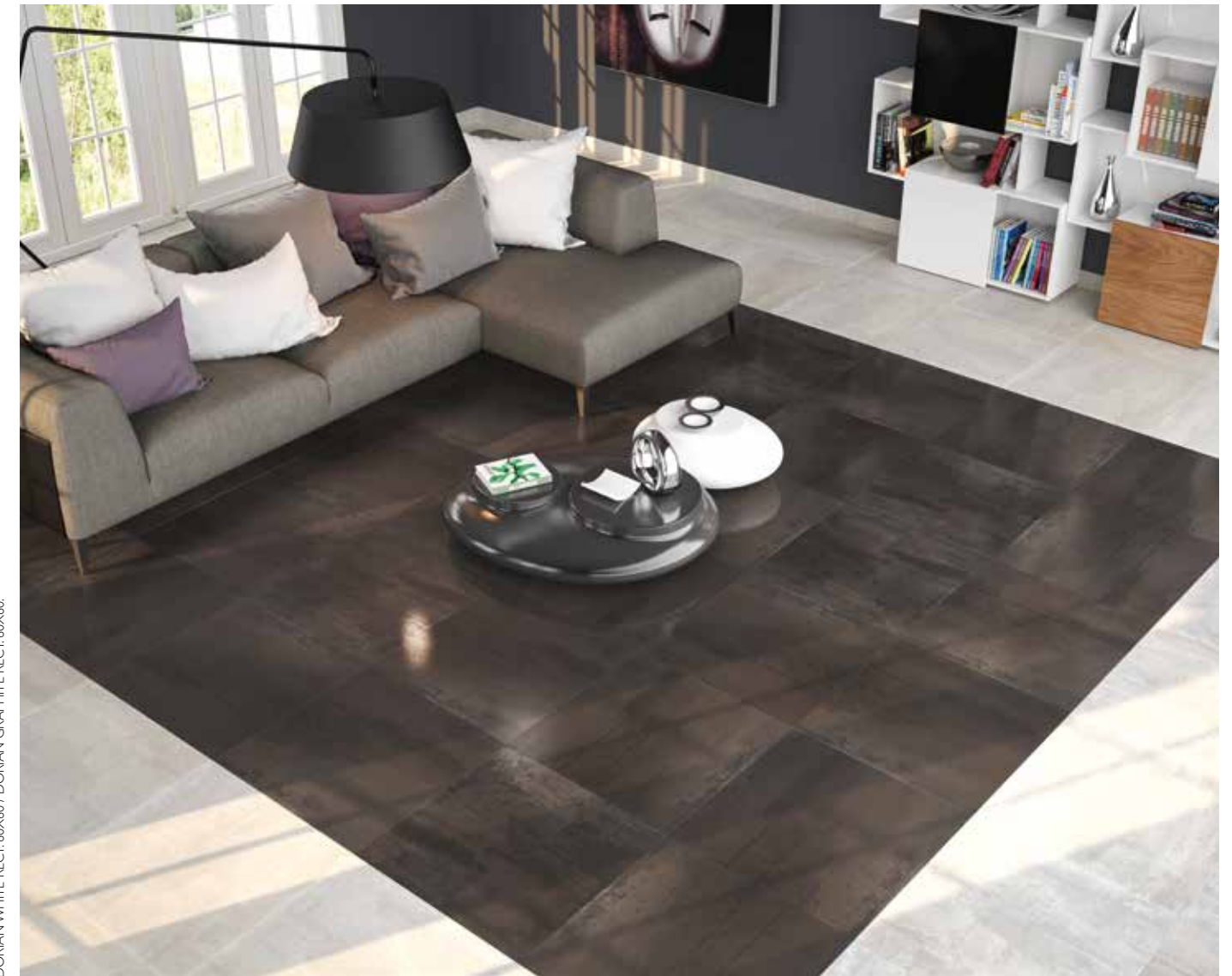
DORIAN WHITE RECT. 60X60 / DORIAN GRAPHITE RECT. 60X60.

DISPONIBLE EN TODOS LOS COLORES / AVAILABLE IN ALL COLORS