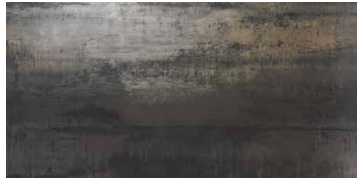
DORIAN GRAPHITE RECT. 60X120 / 24"X48" T45/M