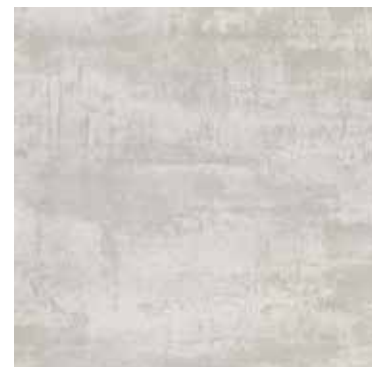
DORIAN WHITE RECT. 60X60 / 24"X24" T01/M