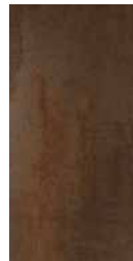
DORIAN BROWN RECT. 30X60 / 12"X24" T04/M