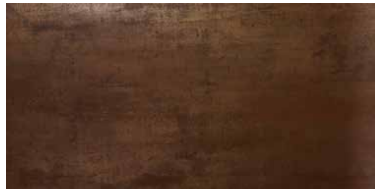
DORIAN BROWN RECT. 60X120 / 24"X48" T45/M

60X120 - 60X60 - 30X60 / 24"X48" - 24"X24" - 12"X24"