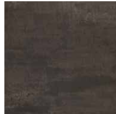
DORIAN GRAPHITE RECT. 60X60 / 24"X24" T03/M