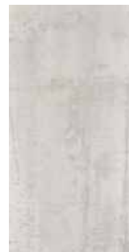
DORIAN WHITE RECT. 30X60 / 12"X24" T01/M