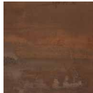
DORIAN BROWN RECT. 60X60 / 24"X24" T03/M