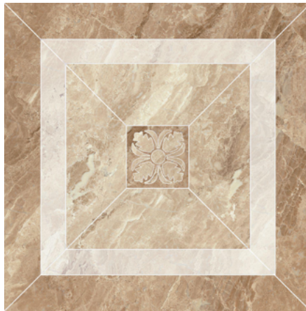
KENIA DARK B27