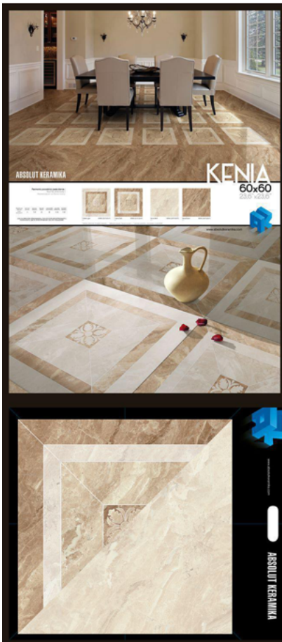
PE KENIA DARK 60X60 (80X180)