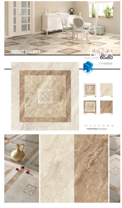
PT KENIA LIGHT 60X60 (100.5x192.5)