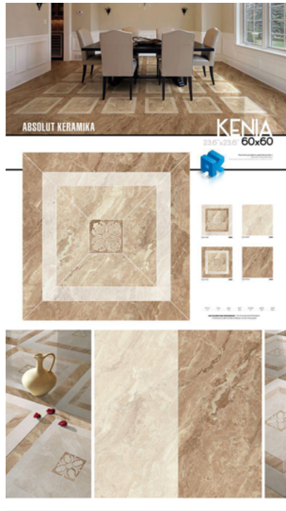
PT KENIA DARK 60X60 (100.5x192.5)