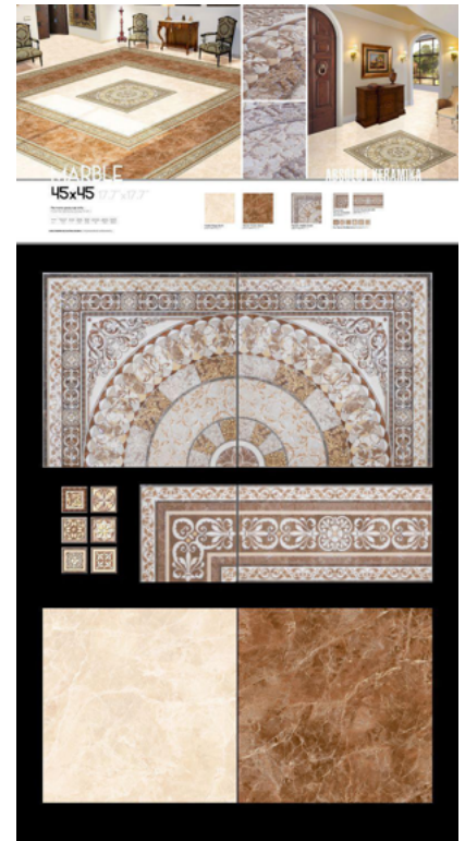
PT MARBLE 45X45 (100.5X192.5)