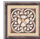
TACO MARBLE 6X6 P05