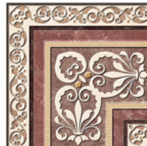
ESQUINERA MARBLE 22X22 P17