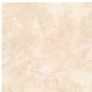
MARBLE BEIGE 45X45 B09