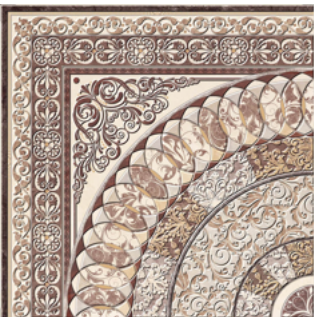
ROSETON MARBLE 90X90 P236