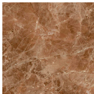
MARBLE MARRON 45X45 B09