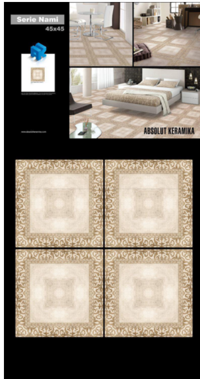
PT NAMI 45X45 (100.5x192.5)