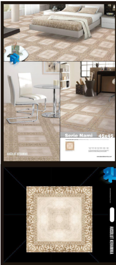
PE NAMI 45X45 (80X180)