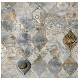
SANTORINI 60X60 B30