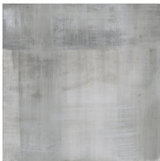
CORFU MG 60X60 B27