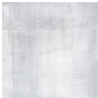
CORFU G 60X60 B27