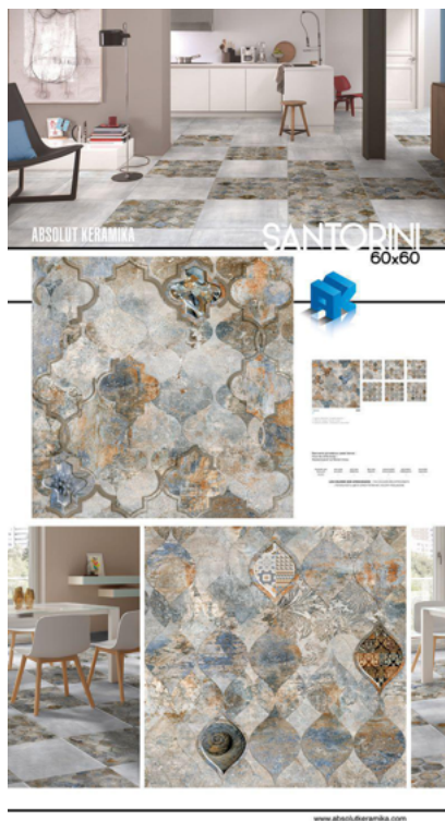
PT SANTORINI 60X60 (100.5x192.5)