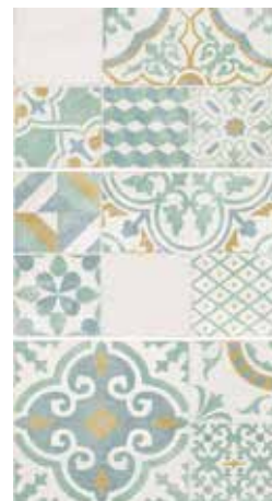
PROVENCE MIX WHITE 25X40 / 10"X16" T44/M