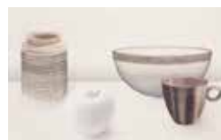
DECOR TASE I WHITE 25X40 / 10"X16" T16/P