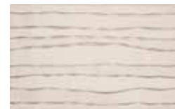
DECOR SMART TIE 25X40 / 10"X16" D03/P