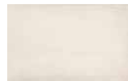
SMART TIE 25X40 / 10"X16" B03/M