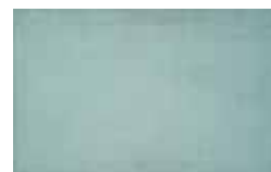
SMART AQUA 25X40 / 10"X16" B03/M