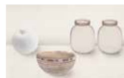
DECOR TASE II WHITE 25X40 / 10"X16" T16/P