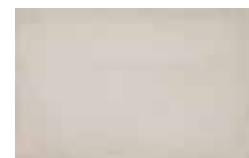
SMART CLOTH 25X40 / 10"X16" B03/M