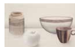
DECOR TASE I TIE 25X40 / 10"X16" T16/P