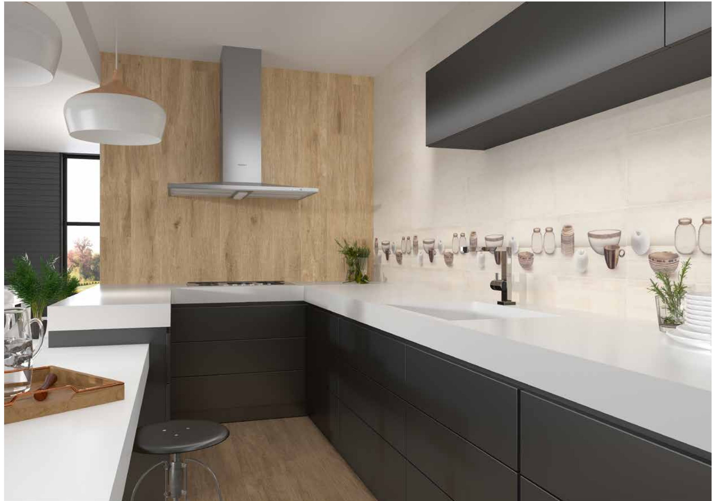
SMART TIE 25X40 / DECORTASE I YITIE 25X40.