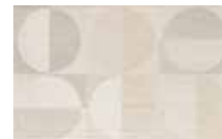
DECOR SETTANTA TIE 25X40 / 10"X16" D03/P