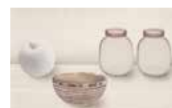
DECOR TASE II TIE 25X40 / 10"X16" T16/P