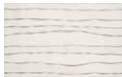
DECOR SMART WHITE 25X40 / 10"X16" D03/P