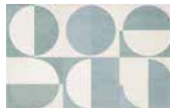
DECOR SETTANTA WHITE 25X40 / 10"X16" D03/P