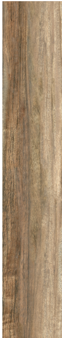
PMc TOBAGO B 20x114 (40x80)