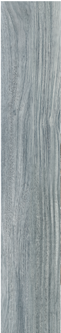
PMc TOBAGO G 20x114 (40x80)