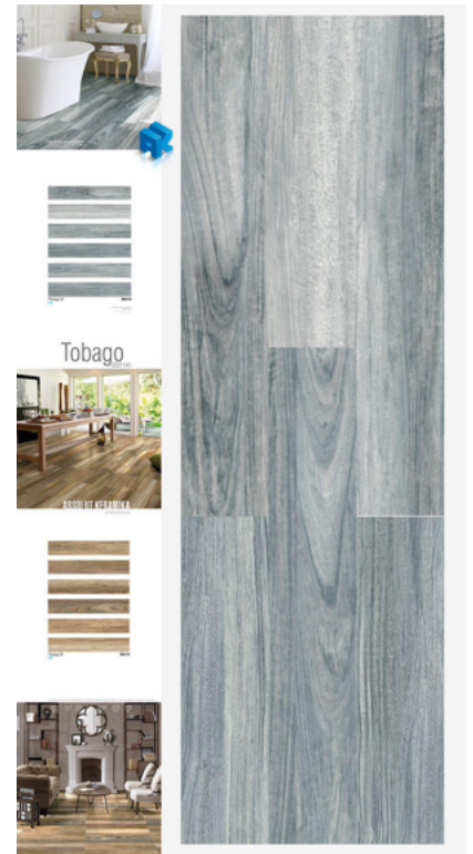
PT TOBAGO G 20X114 (100.5x192.5)