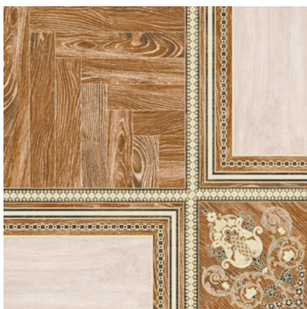
VERSALLES 45X45 B21